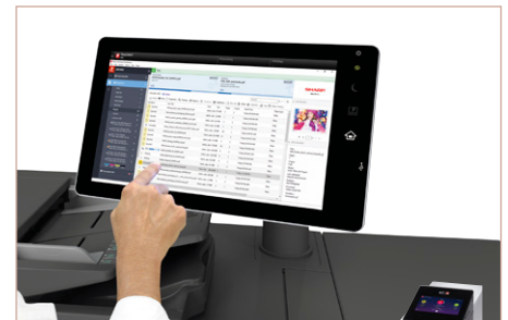
MX-8090N shown with Fiery Command WorkStation fully integrated at the Sharp control panel, included with the MX-PE13 Fiery Print Server.