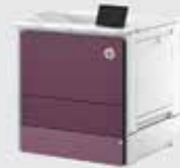
HP Color LaserJet Enterprise X654dn shown in Aurora Purple color panel option