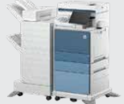
HP Color LaserJet Enterprise Flow MFP X677z+ shown in default Atmosphere Blue color panel option