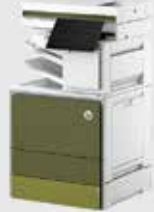
HP Color LaserJet Enterprise Flow MFP X57945zs shown in Cosmic Green color panel option