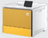
HP Color LaserJet Enterprise X55745dn shown in Constellation Yellow color panel option